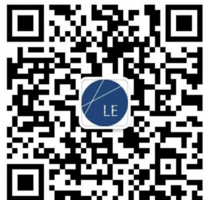
WeChat QR code